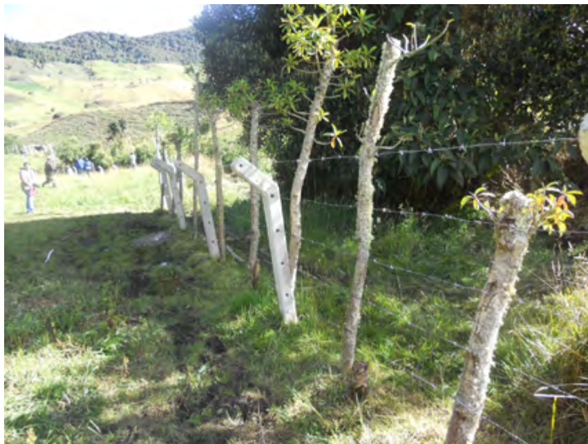
In Carchi, Ecuador, Water User Groups build fences and plant trees to protect a spring that runs between ranch lands and potato fields and is threatened by agrochemical and manure contamination, (illegal) deforestation and soil erosion.