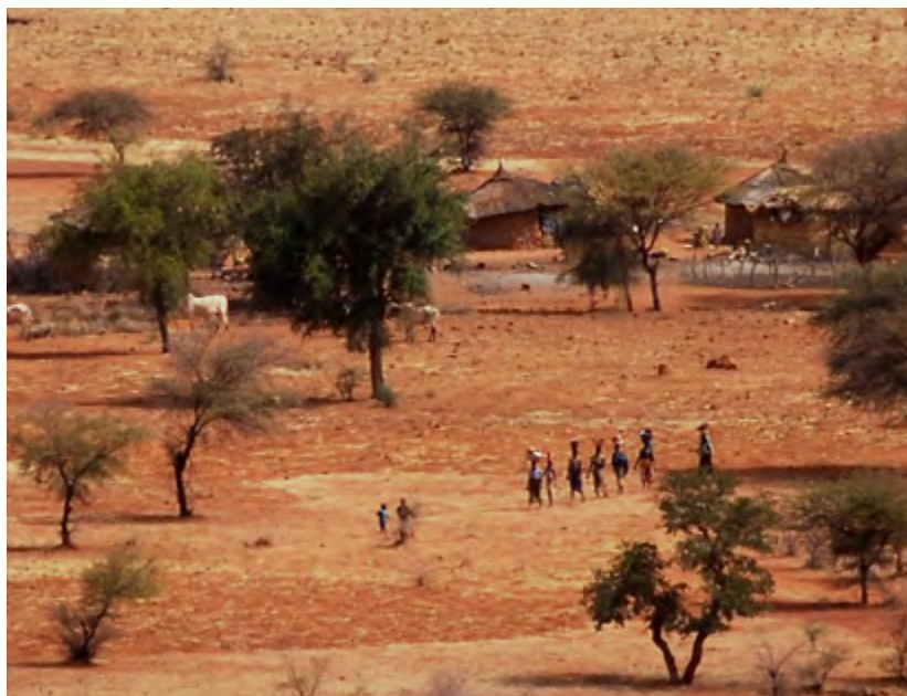
Farmer managed natural regeneration is helping to regenerate woodlands and productive drylands in the West African Sahel.

FMNR hinges on taking advantage of local wisdom and traditional methods. For example, in a centuries-old practice, FMNR manages native