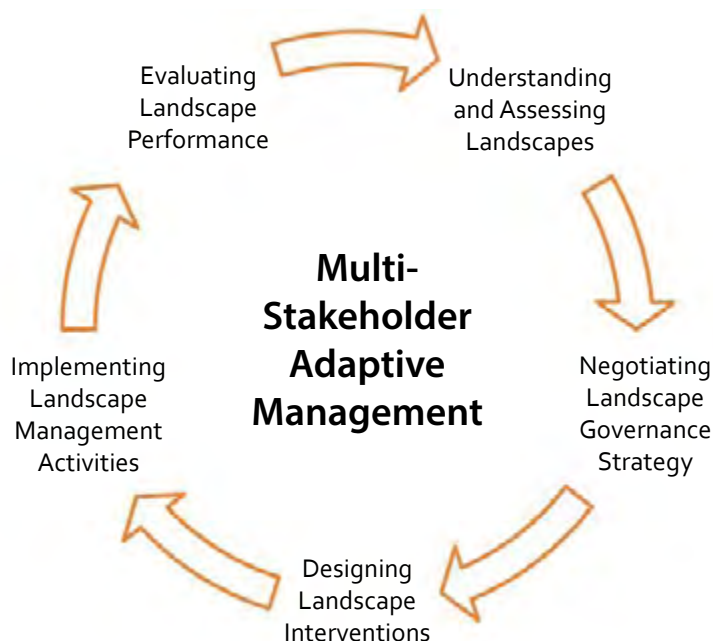
Figure 2. Phases in a collaborative stakeholder management process for building resilient integrated landscapes.

strategies for landscape governance can give attention to interactive learning processes and inclusive decision-making rules to help ensure that innovations and representation are drawn from multiple sources. Designing multi-objective interventions will help prevent a proliferation of single-sector sub-projects known as 'siloes'. Monitoring systems that account for multiple landscape performance criteria, and use of integrative indicators and means of measure will further help to address synergies and tradeoffs among multiple desired outcomes from landscape management. Buck et al (2007) describe a cross-sectoral 'landscape measures approach' for guiding landscape management. A corresponding 'landscape measures resource center' can be useful in operationalizing the approach ( http://landscapemeasures.info ). Ground based photo-monitoring can be an especially useful tool for engaging local communities and other stakeholders in assessing landscape potentials and performance on the basis of readily visible indicators of conditions and interventions likely to affect socio-ecological resilience (Lassoie, Myron, and Buck 2014).