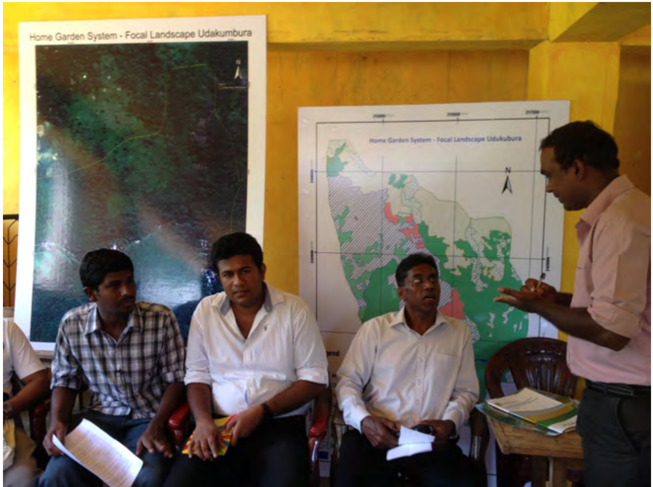
Stakeholders from Udakumbura, Sri Lanka at a landscape planning dialogue. Forums for coordinated decision-making can improve capacities for adaptive management of ecological and livelihood assets.

tools are available to help design optimal interventions, as well as monitoring systems that capture their multiple intended impacts. The multi-stakeholder adaptive management process that is featured at the center of the socio-ecological resilience framework can be usefully guided by attention to the phases of the adaptive management cycle depicted in Figure 2.