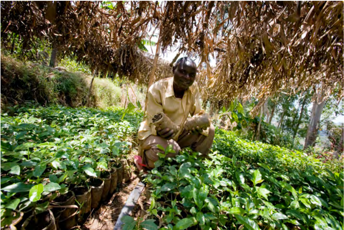
A man tends to his newly planted tree seedlings in a nursery on Mount Elgon in Arokwo Village, Kapchorwa, Uganda.

The slopes of Mt. Elgon, a 4-km high extinct volcano that straddles the Kenya-Uganda border, are home to a growing human population, a rich variety of altitudinal vegetation zones and wild fauna, and a 1,145 square kilometer national park with proven tourism value. The mountain is important for watershed protection, as a major source for the Kenya, Uganda and wider Nile Basin ecosystems and at least 12 rivers and streams (Nordic Development