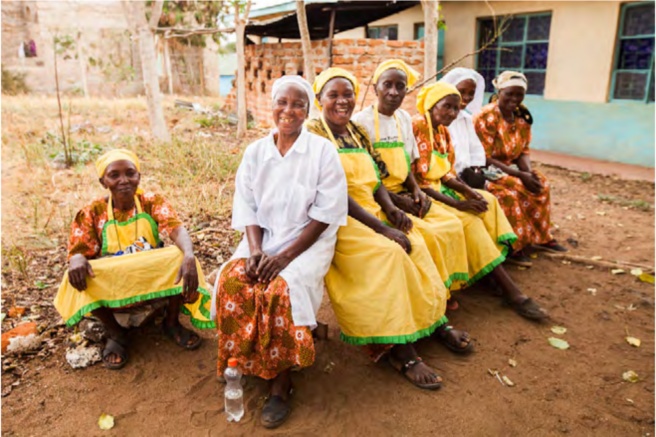
In Kenya, the Huruma Women's Group is receiving support to turn their maize and other staple crops into value-added baked goods for sale in local markets, generating additional income and increasing food security for the women and their families.

Integrating local, cultural, scientific, experiential, and experimental knowledge is widely considered an essential ingredient in integrated resilience-building strategies. It implies and entails a participatory approach to management that promotes collaborations between farmers, vulnerable community members, national and international governmental institutions, and development partners. For example, many projects promote the formation of community groups that include multiple stakeholders where questions of management goals, processes of implementation, and modes of inclusion are negotiated. And in turn, community groups must learn to communicate and negotiate with stakeholders at other levels to advance landscape level management. Designers and facilitators of these processes need to explicitly value multiple knowledges to promote innovation as well as equity in participation and decision-making.