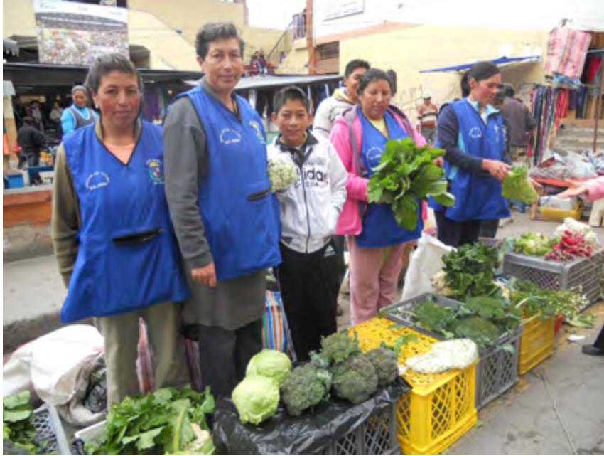
The PRRO project increases sales for the Siembras de Futuro women's association of organic vegetable producers by providing access to new markets.

strengthening community resilience to environmental risks as well as food and nutrition security.