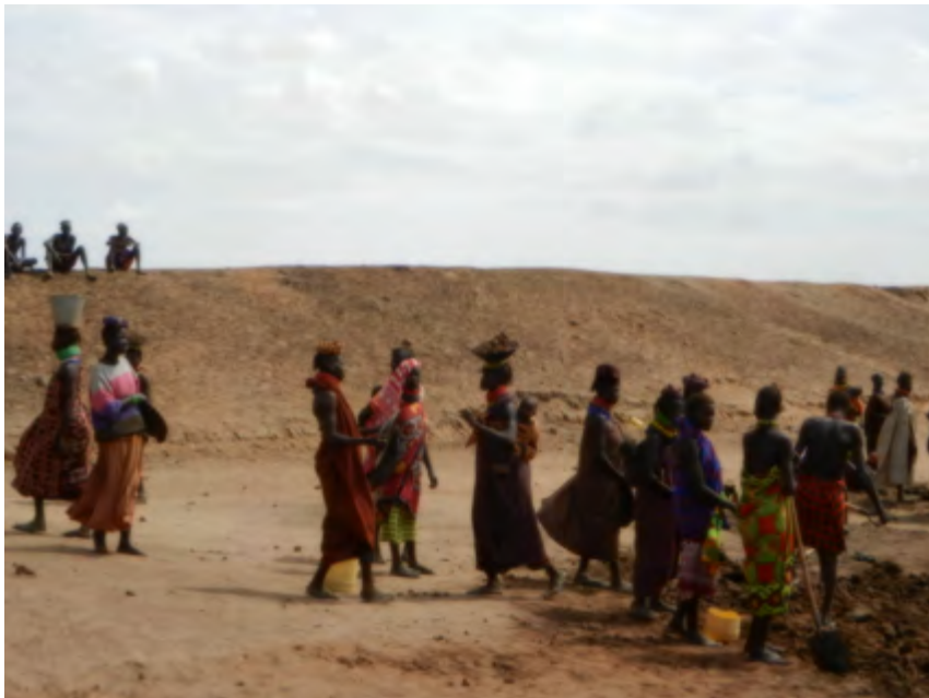
Women maintain a water pan in Turkana County, Kenya.

FFA program sites in Turkana already are showing early improvements in agroecosystem resilience. Turkana County has intensified its production appreciably through small-scale irrigation and moisture harvesting. Farmers