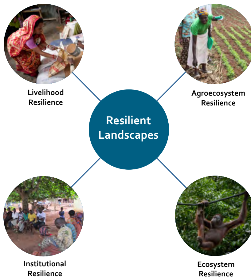
Figure 1. Components of resilient landscapes.